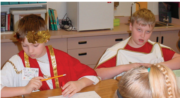
6th grade ancient Greeks

Dakota Step State testing for 3rd, 4th, 5th and 6th grade students will begin on March 29th and continue through April 23rd. Successful testing includes regular school attendance, consistent bedtime, a healthy diet, and exercise.