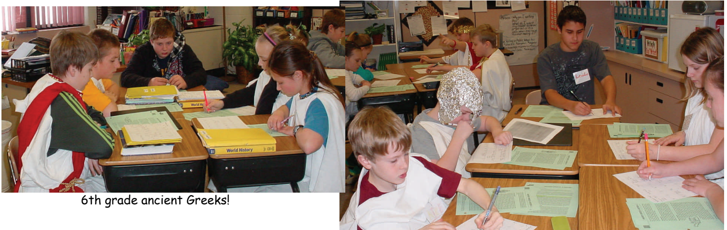
6th grade ancient Greeks!